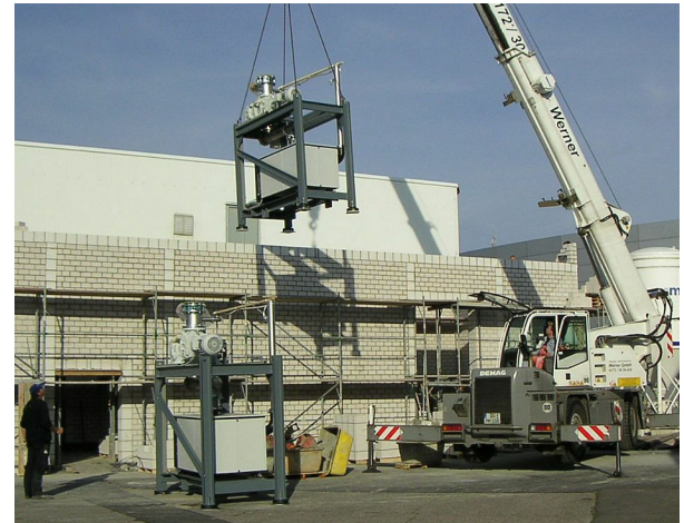
Figure 2: Linde TCF-50 Cold-box for 180 l/hr, 4.2-K LHe production (top), and Leybold vacuum pumps for 80-W, 1.8-K HoBiCaT operation being installed in the pump room (bottom).